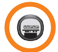
Automated Meter Reading