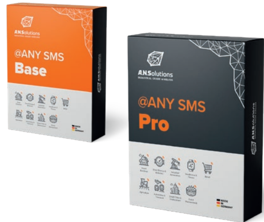
SMS Base and SMS Pro

Smart MAC Suite includes several software parts (figure 1., page 2). In addition to the support of the RF portion, it also takes care of the GPIO control logic, the temperature sensor on the @ANY Brick board and several other interfaces, such as the UART interface to interact with a host. SMS is utilizing a Media Access Controller, which implements all IEEE802.15.4-2006 functions. And since there are applications out in the field, which cannot afford an additional host intelligence, A.N. Solutions implemented features in SMS, which allow it to run a network node without any further intelligence . This means that no host is required .