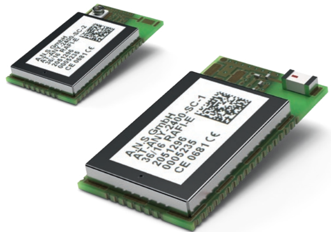
Mechanical module size 24 x 13.5 x 3 mm

With AT-ANY2400-SC module's impressive feature set, creating ambitious wireless IoT designs becomes a breeze.