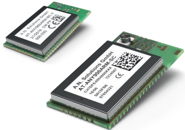
Mechanical module size 24 x 13.5 x 3 mm

Thanks to AT-ANY modules' impressive feature set, creating ambitious wireless IoT designs becomes a breeze.