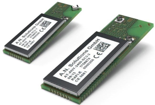
Mechanical module size 40 x 13.5 x 3 mm

Thanks to @ANY modules' impressive feature set, creating ambitious wireless IoT designs becomes a breeze.