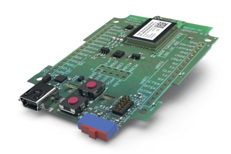
Mechanical module size 68.5 x 46.5 x 5 mm

Our Smart MAC Suite AT-command-based firmware and the included application examples guarantee a quick bring-up.